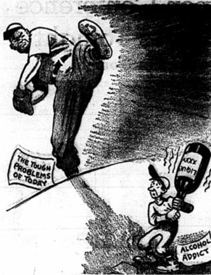
He who sacrifices his conscience to ambition burns a picture to obtain the ashes.—Chinese Proverb