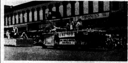
The UNESCO float pictured above was one of the two McPherson College entries in last year's May Day Parade.

McPherson College was well represented yesterday in McPherson's day of days as it entered a float and the McPherson College band in the May Day parade.