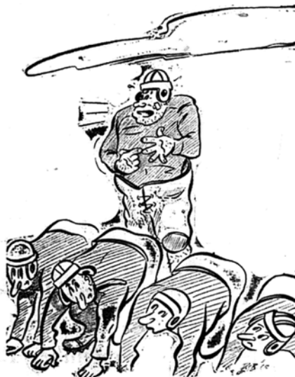
"Hop, one, two, or three, or . . . ough . . . shhh . . ."