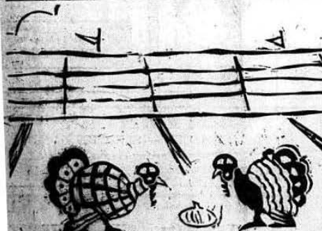
Left end to opponent: As a football player, you're easy meat. Reply: You're not so tough yourself.